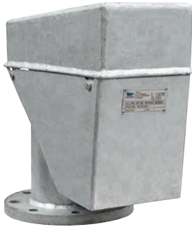
BOLERO PN10 - DN 40-250