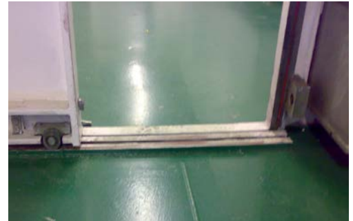
Option: Low sill

Limited to 8,5 mWc (i.e. test pressure) at size 2100x1400 mm