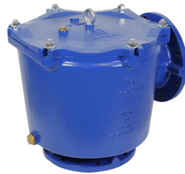
Mudbox Angle type 482751 with drain plug