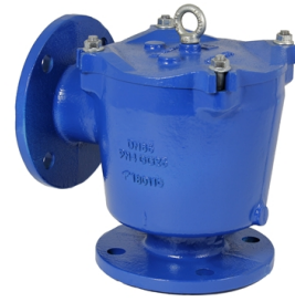
482751 Mudbox product image

Fuel oil, lubricating oil and flammable hydraulic oil. Seawater and freshwater.