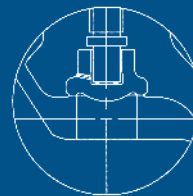
Screw Down Non Return (SDNR)