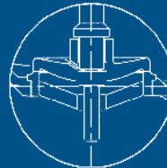
Screw Down Non Return (SDNR)